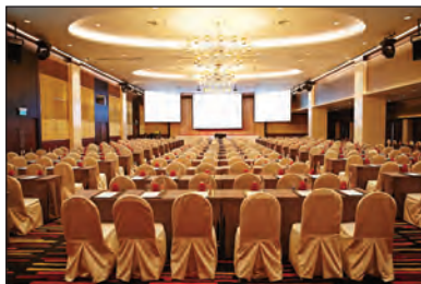
Hotels and conference centers