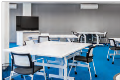
Classrooms, lecture halls, faculty meeting spaces