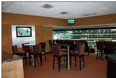
Entertainment venues and arenas