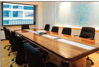
Corporate meeting rooms

FSR's OWB-CP1 wall box series is a NEMA-4 style enclosure able to mount 2 or 3-gang control panels outdoors.